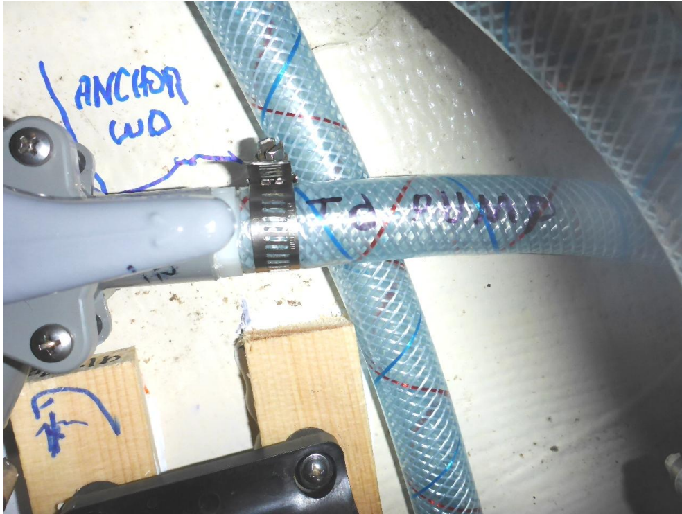
008-hose to bilge pump