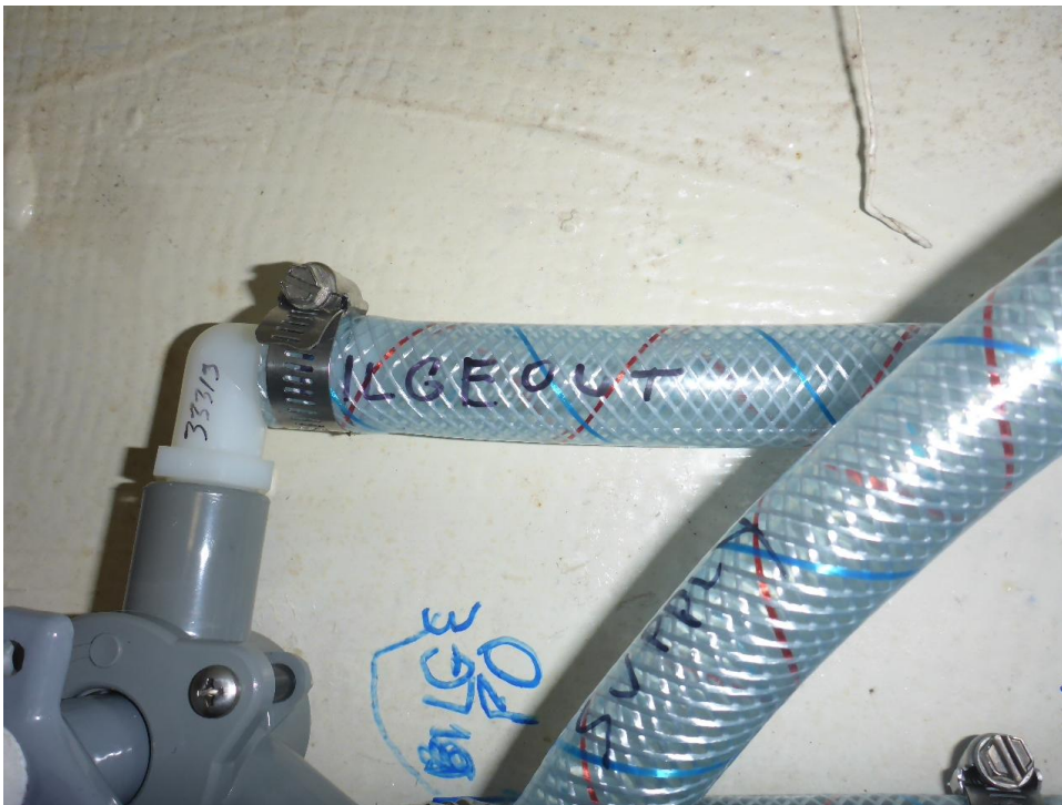
007-Bilge out hose