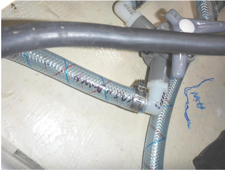
004-anchor washdown hose