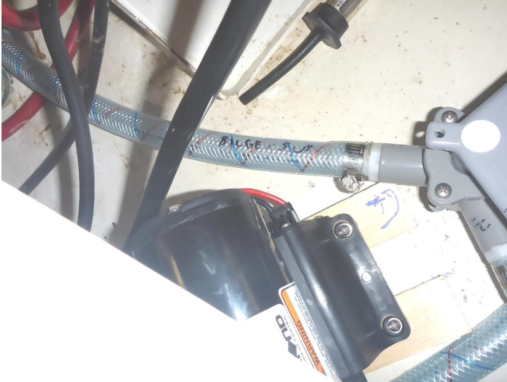
006-Bilge supply hose