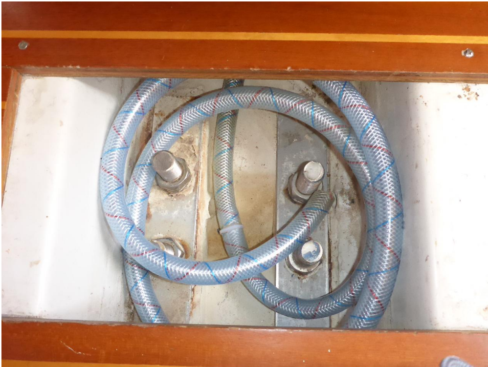
011-hose coiled in forward DRY bilge