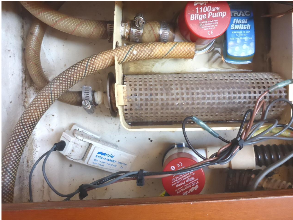
013-aft main bilge-DRY - clear water in shower bilge