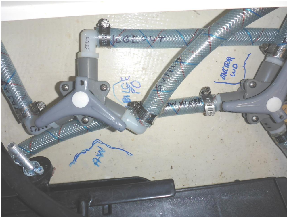
003-anchor washdown-bilge pump system

In 04/2015, Helmkamp designed and installed a single Flo5.0 diaphragm water pressure pump, model 42755, with two y-valves that can serve as both an anchor washdown pump system and a manual bilge pump system. The macerator pump was broken and was not going to be used in the Chesapeake Bay, so the existing raw water intake valve under the starboard settee was used to bring in water for the washdown pump in the anchor locker. The pump is powerful enough to produce a strong volume of water to the anchor locker. A coiled hose was left in place in the forward bilge compartment to reach all three bilge areas, under the holding tank and under the galley sink, and even the fresh water tank under the port settee. The hose is not long enough to reach the forward water tank but I can probably attach another hose to the coiled hose to pump out the forward water tank. All bilge areas have been bone dry for several weeks. Parts and 9.5 hrs labor... $1,100. A dry bilge...priceless.