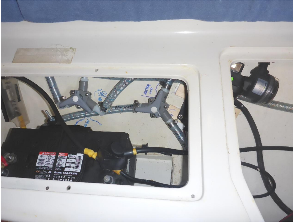
014-view of open compartments under starboard settee