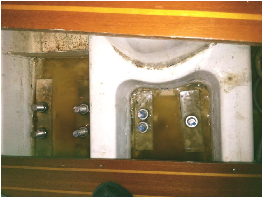
002-Before – water in forward and middle bilge areas