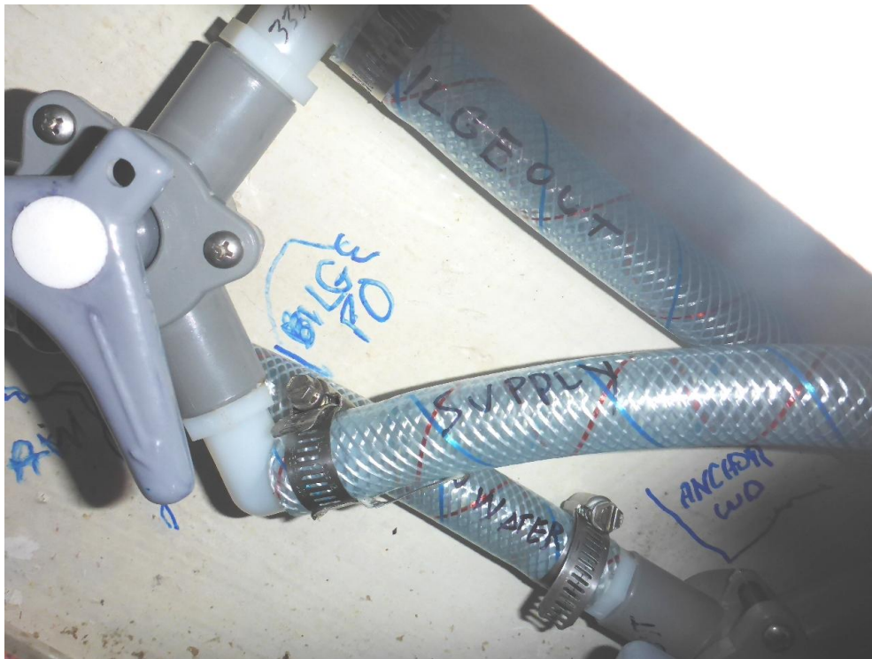
005-Supply and raw water hoses