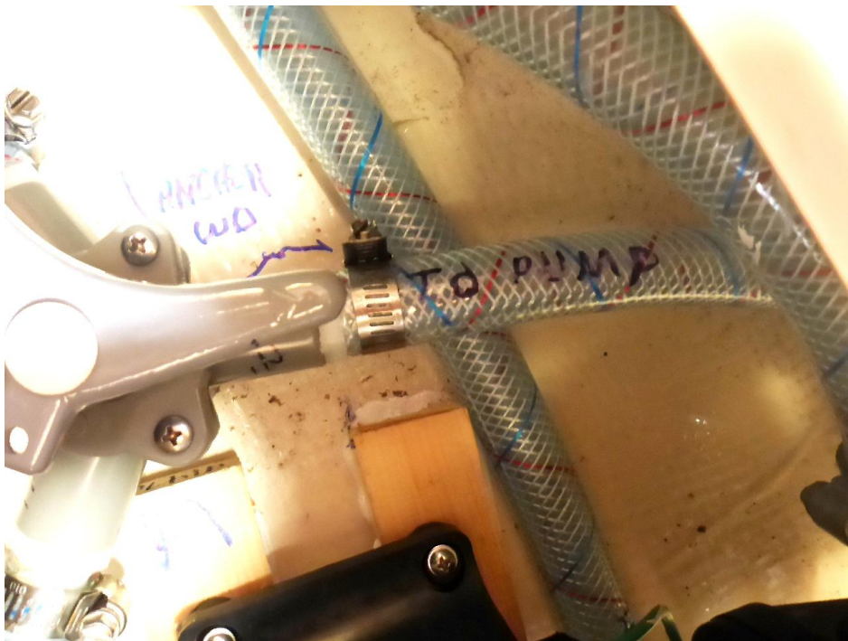
009-hose to bilge pump