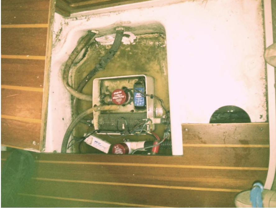
001-Before – dirty water in both bilges